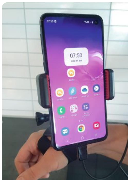
Fig. 3: Showing the cell phone setup, which was used in a study on remote meat inspection.