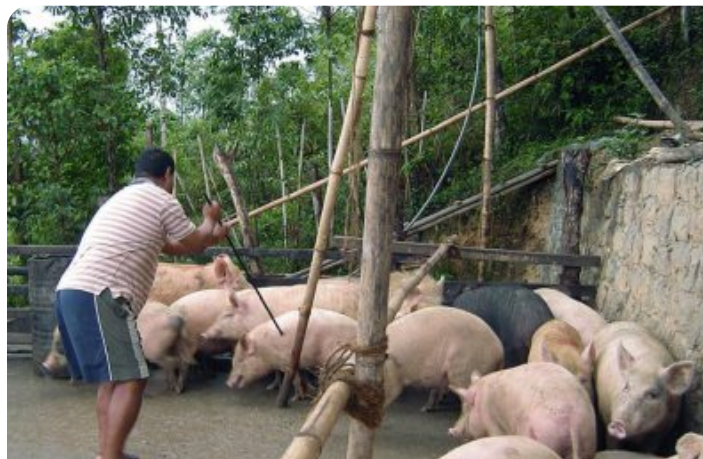
Fig. 5: Pig slaughter in Nagaland, North-east India, by spearing – a relatively quick and humane method

Low- and middle-income countries face several challenges in assuring the quality of meat. Firstly, many animals do not undergo any inspection before or after slaughter. Poultry, small ruminants, and pigs are typically slaughtered informally by households or food establishments using traditional methods, as noted in Figure 5. In Kampala, Uganda, for example, there is only one official abattoir for pigs, and at least half of the pigs in this capital city are slaughtered informally (ATHERSTONE et al., 2019). Secondly, while most cattle and buffaloes are slaughtered in official abattoirs or